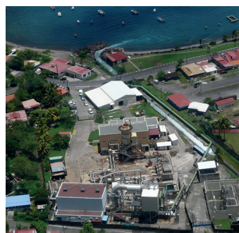
BOUILLANTE GEOTHERMAL POWER-PLANT