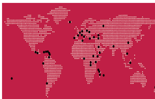
BRGM ACTIVE IN SOME 40 COUNTRIES