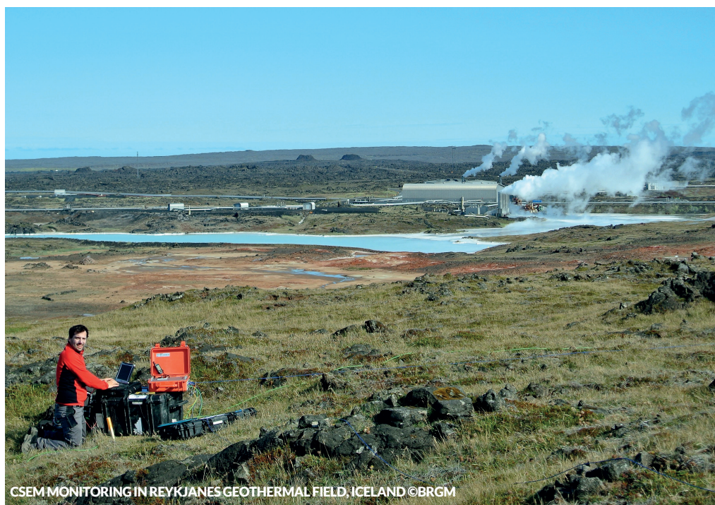
CSEM MONITORING IN REYKJANES GEOTHERMAL FIELD, ICELAND

GEODEEP FRENCH GEOTHERMAL CLUSTER FOR HEAT AND POWER